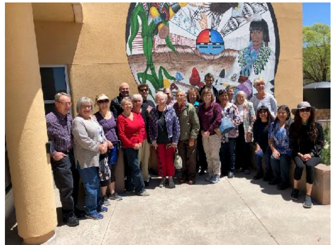
The part of the Doctrine of Discovery group from Presbytery that went to Zuni.